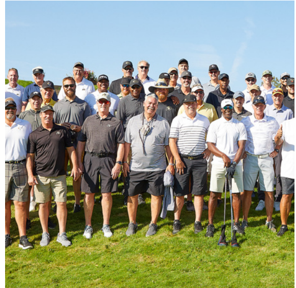
11th Annual Kyle MacIntosh Memorial Fun Run

Sunday, June 26 Franklin Field-CU Boulder Campus